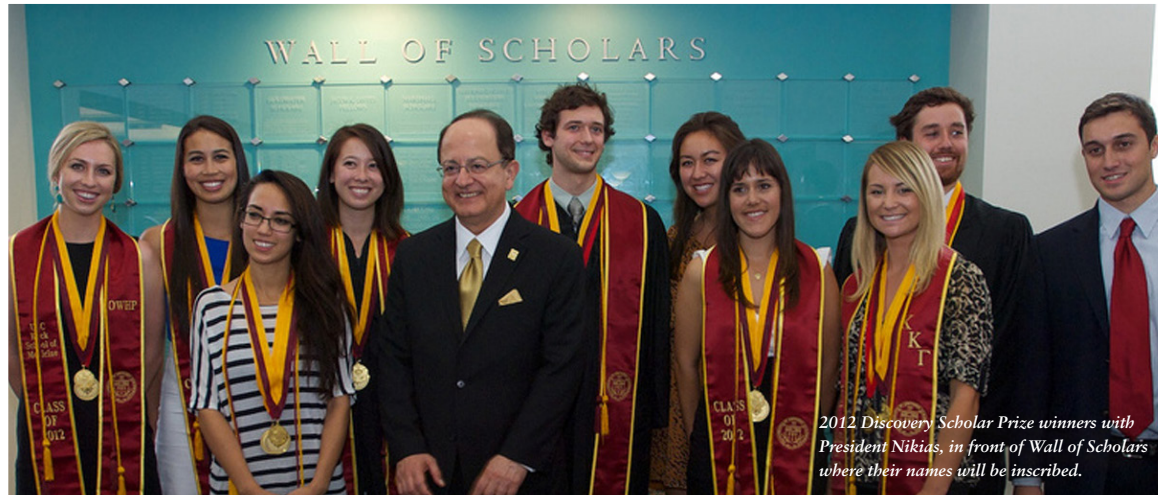
2012 Discovery Scholar Prize winners with President Nikias, in front of Wall of Scholars where their names will be inscribed.

We were honored to receive over 47,000 applications for admission – another record-breaking year. Students applied from 8,700 different high schools, 50 states, and 132 countries and promise to comprise the most accomplished and diverse first-year class ever!