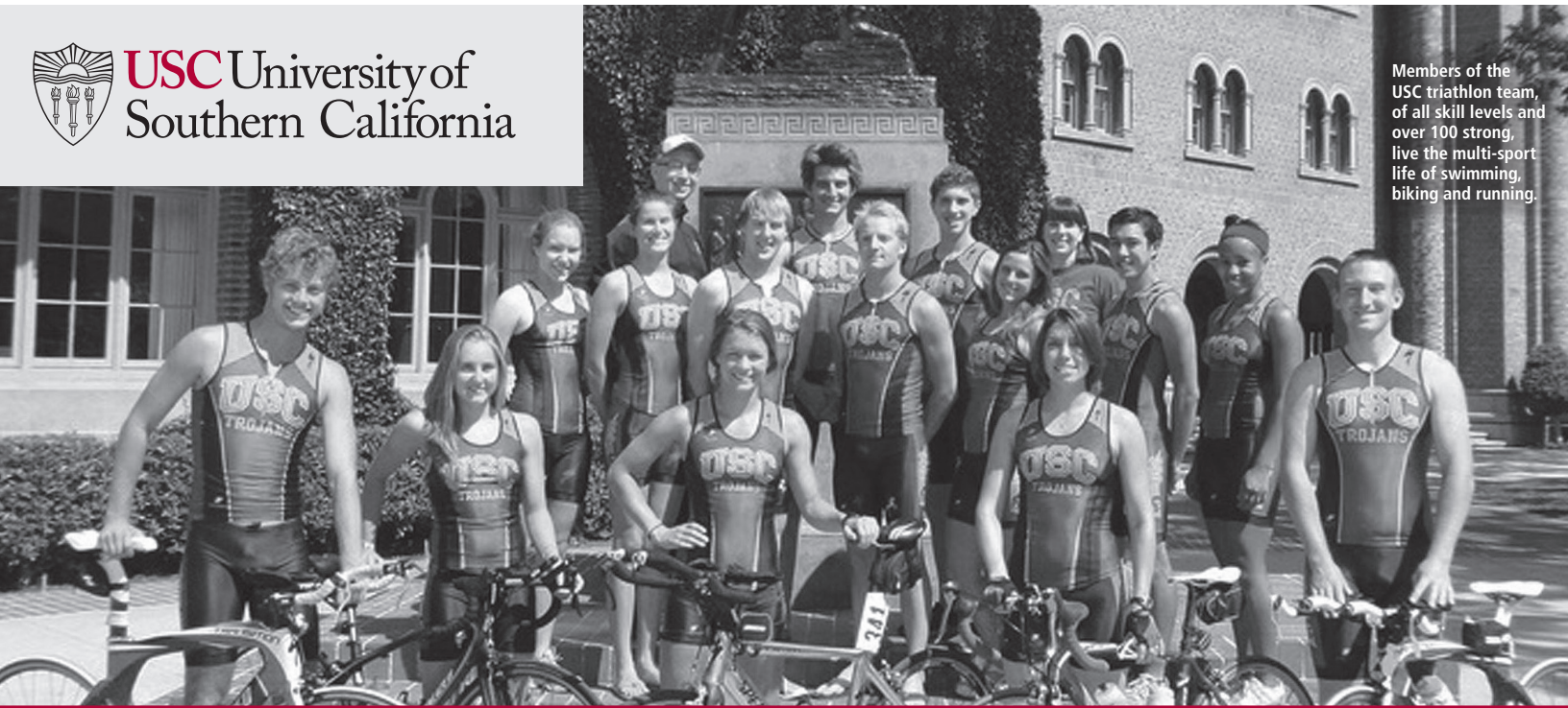
Members of the USC triathlon team, of all skill levels and over 100 strong, live the multi-sport life of swimming, biking and running.